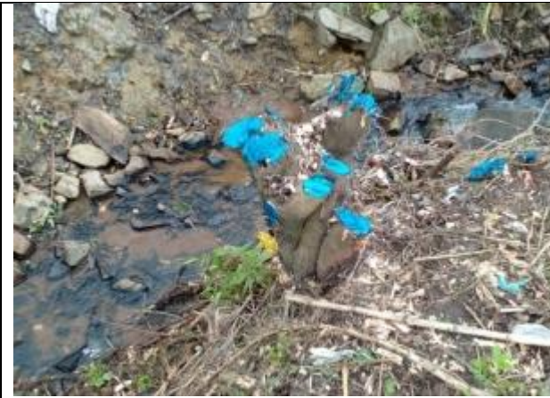
Picture 3: Brazilian Pepper cut, stumped and painted with herbicide.