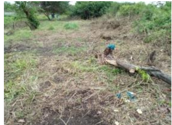
Picture 2: Syringa cut down and herbicide applied; Chromolaena was slashed and sprayed