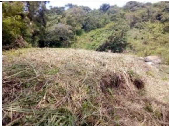
Picture 7: Giant-reed ( Pennisetum purpureum ) slashed along the high-points of the river banks.