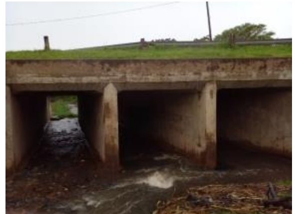
Picture 6: Debris was removed as part of alien plant control teams and water is flowing.