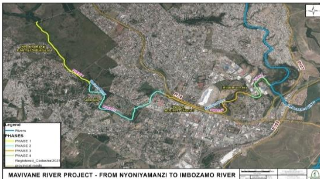
Figure 1: Mavivane River Phase 1 to 4