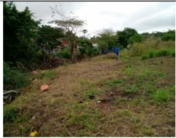
Picture 4: Edges of the river slashed and hand-pulled of invasive plants.