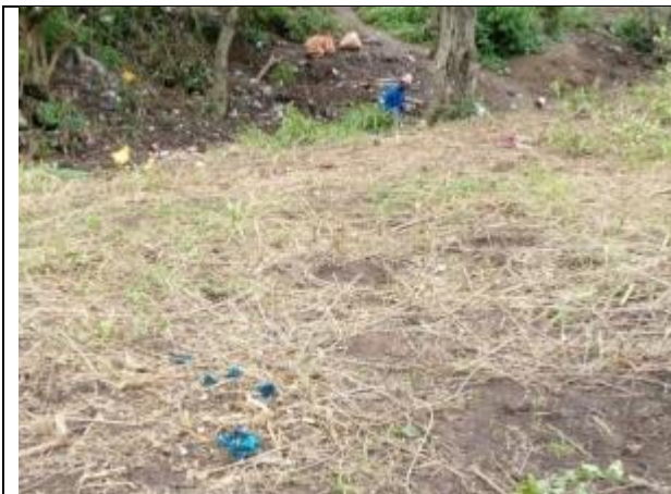
Picture 1: Kaput gel applied to some smaller shrubs including Bonga–Bonga