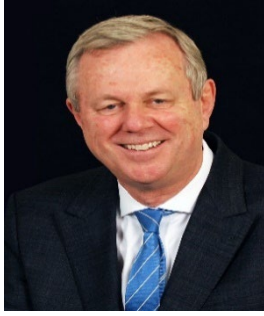
Hon. Mike Rann AC CNZM Chair of the Board of Trustees